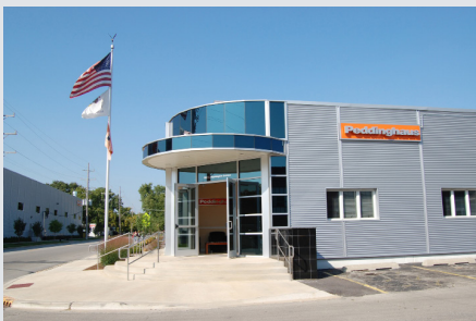
Peddinghaus Corp Bradley, IL, USA

Welders keep busy with the 25,000 ton capacity and two production lines at the Ballinamallard-location.