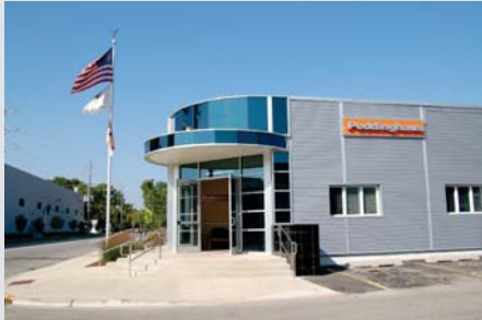
Peddinghaus Corp Bradley, IL