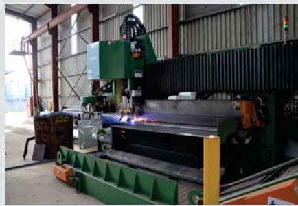
Step 2: Process Material on HSFDB