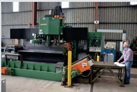
The side unloader of the HSFDB delivers finished parts directly to the operator at an ergonomic height.