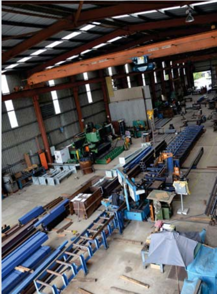
The Ocean Avenger Beam Drill Line is essential for the production of structural components at Universal Steel

value added services for clients, Universal Steel is a family business with no signs of slowing down any time soon.