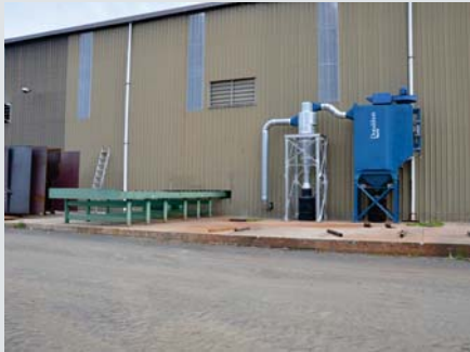
Step 1: Load Stock Plate Outside