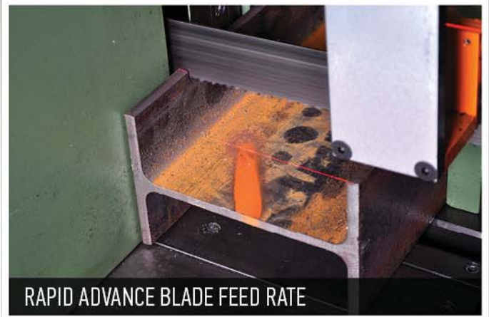
RAPID ADVANCE BLADE FEED RATE