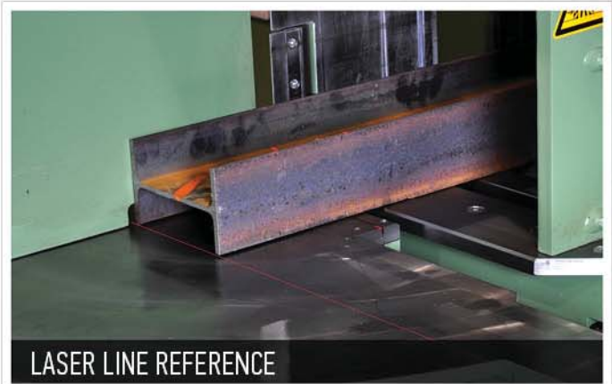
LASER LINE REFERENCE