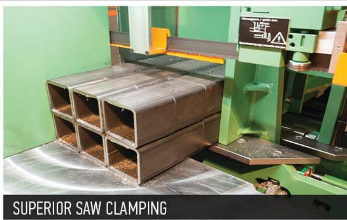
SUPERIOR SAW CLAMPING